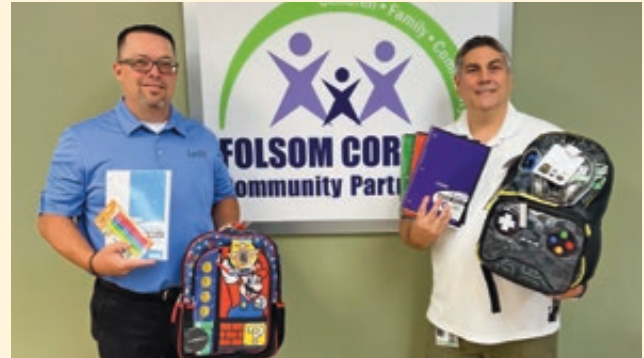
Folsom Cordova Community Partnership

This spring, several team members had the opportunity to contribute their time and talents to the City of Rancho Cordova Spring Service Day . First U.S. volunteers and their families spent a day on home renovations and cleaning up creek and local wetland areas, all for the betterment of our local communities. We believe that small acts of kindness can make a significant difference, and we are proud to see our team members stepping up to lead these efforts.