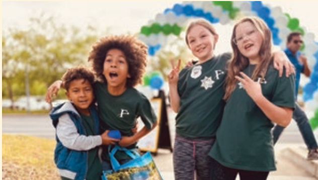
City of Rancho Cordova's Spring Service Day

At First U.S., making a difference our community isn't just part of our mission; it's at the heart of everything we do. We take pride in bringing our team members and their families together for various outreach programs and volunteer efforts across our region. By working together, we strengthen our communities and make a lasting impact on those around us.